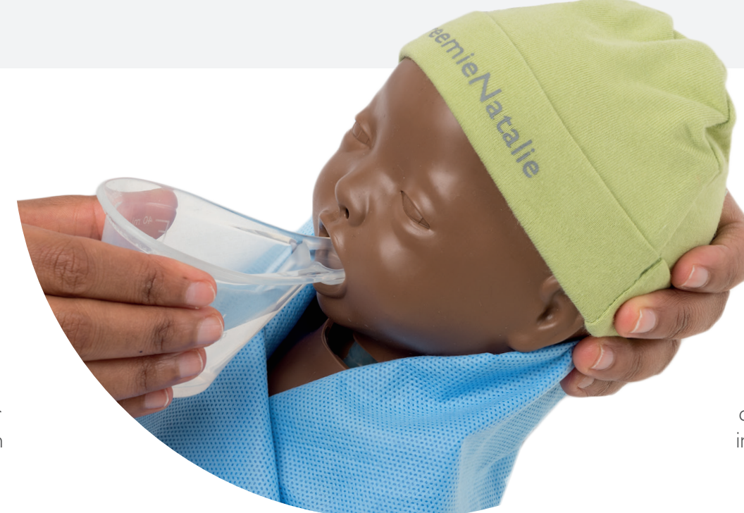
CarePlus Helping Babies Grow

Designed in collaboration with PATH, Univ. of Washington and Seattle Children's, a feeding cup for providing breast milk to infants with breastfeeding difficulties.