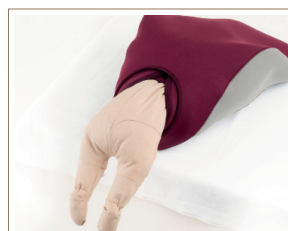
Management of malpresentations including breech and shoulder dystocia can be trained on the table or in simulation mode.