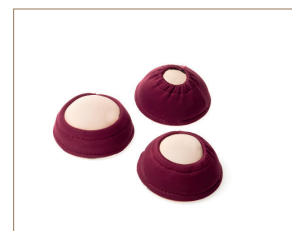
Cervix inserts of 4, 6 and 8 cm dilatation and effacement, in addition to anatomical landmarks in the birth canal, allow for skills training on vaginal examination.