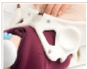
Female external genitalia with urethra, clitoris, labia and stretchable perineum.

Investing in well-trained midwives can save millions of lives each year. In Bangladesh, the training of 500 midwives reduced maternal mortality by over 80% and infant mortality by 75%. (State of the Worlds Midwife 2014)