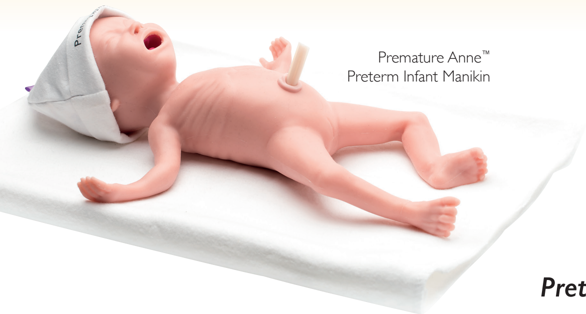
Premature Anne™ Preterm Infant Manikin

How well prepared is your NICU to provide the best possible patient outcomes?