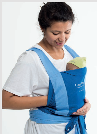
A wrap that helps mothers provide continuous and quality Kangaroo Mother Care.