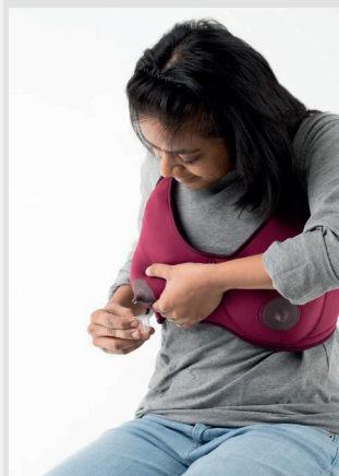
A trainer for realistic breast-feeding and breast-milk expression, nursing and positioning.