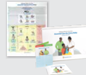
Training course materials