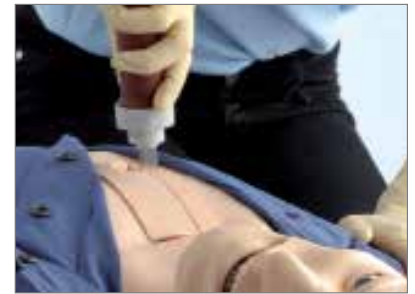
IO insertion optional