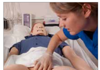
Urine catheterisation system