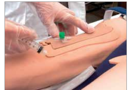
IV training arm