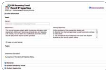
With SimEvents administrative staff can quickly calendar activities to block schedules. Resources, personnel, topics and activities can be added at any time. Students can be assigned individually or by group.