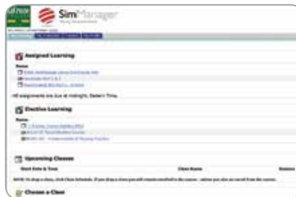
Student interface allows a quick view of upcoming classes and assignments. Students can build a complete transcript of simulation activities plus upload documents for viewing by the instructor.