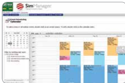
The SimManager calendar is an intuitive tool to gather data and provide quick access to key event information and frequent administrative tasks