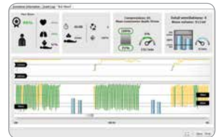
Integrate with Laerdal Instructor Applications, LLEAP, SimPad, Q CPR Manikins, and SimView to display the data log and other debriefing files. Files can be commented on by the instructor and made viewable to students.