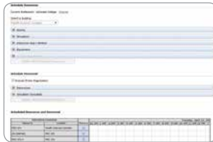
Manage and track the usage of your durable resources such as simulators, task trainers, and equipment. SimManager automatically checks for resource conflicts across all event recurrences.