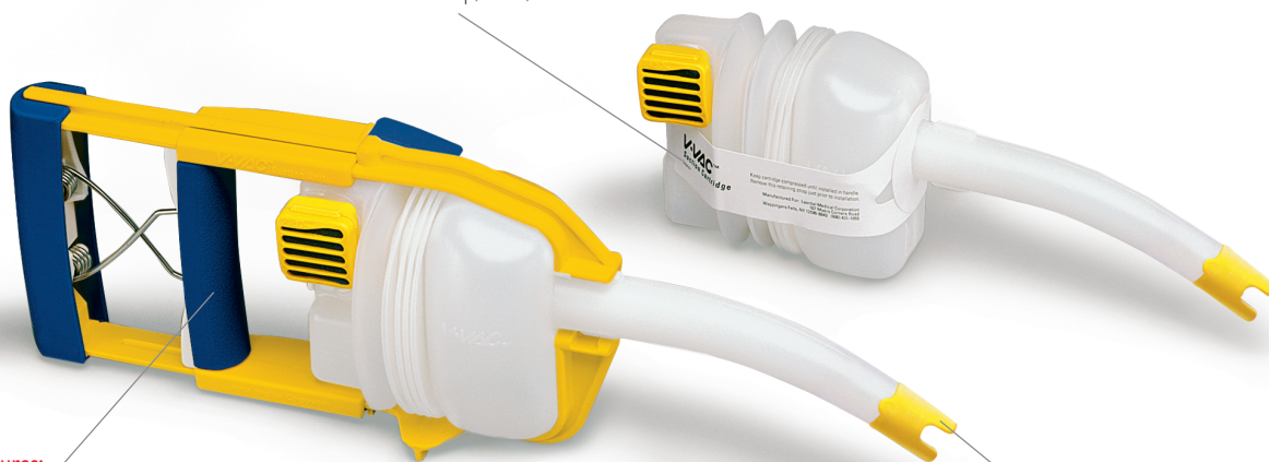
Short Suction Catheter