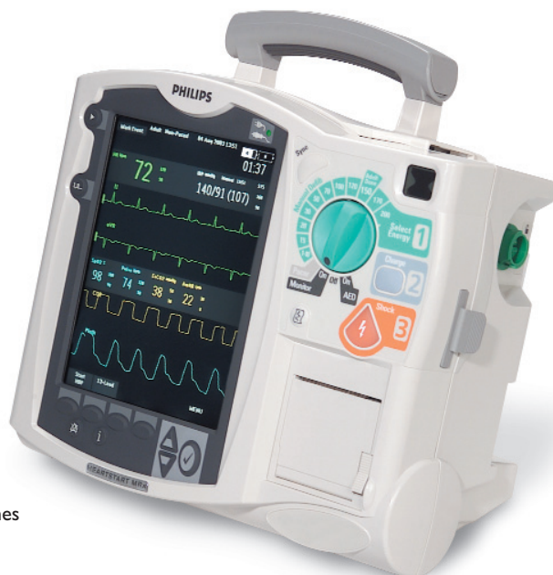
Measures 12.4 x 7.7 x 11.7 inches